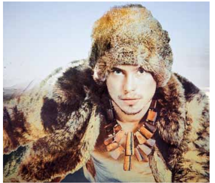
Windows in office buildings, Hammarby Sjöstad. Client: Fabege.