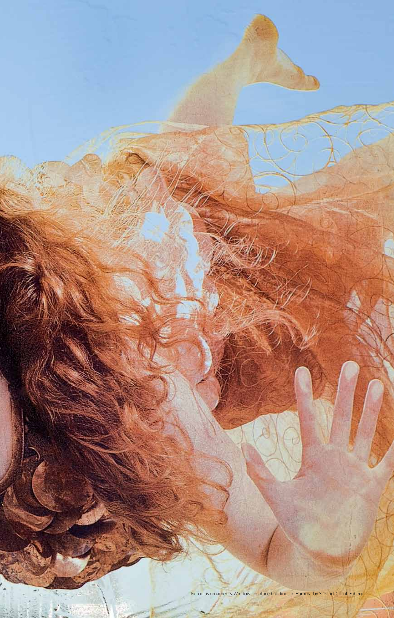
Pictoglas ornaments. Windows in office buildings in Hammarby Sjöstad. Client: Fabege.