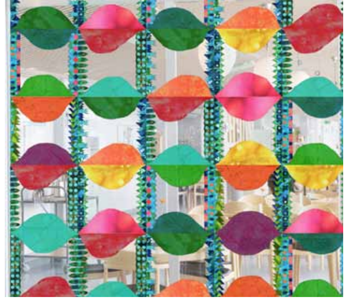
Sketch assignment for headquarters. Client: Södra Skogsägarna.