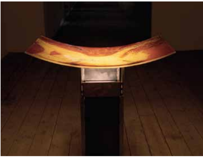
Art object. Pictoglas in a concave shape. Fotografins hus, Stockholm.