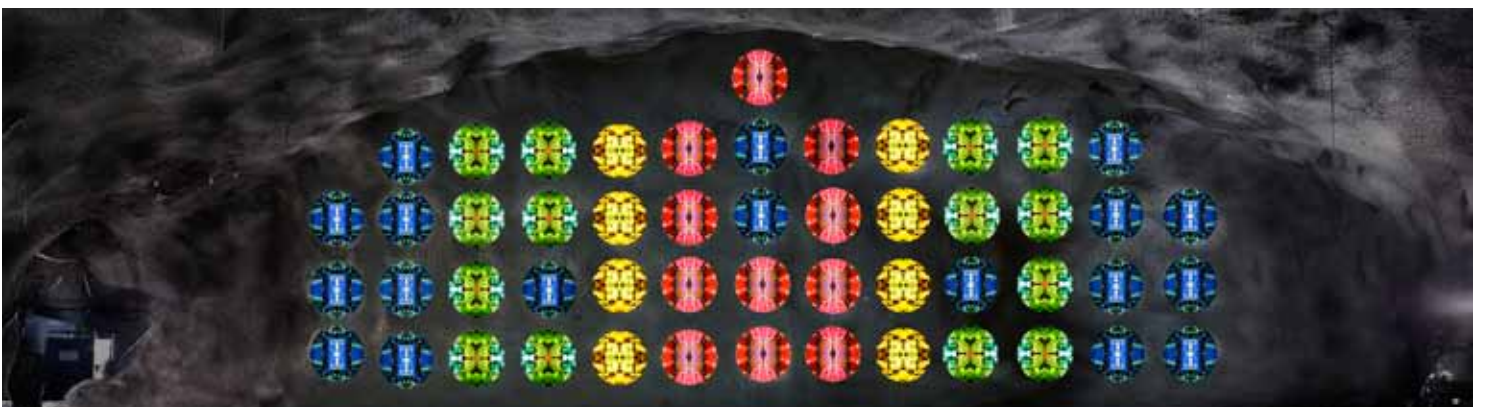
Sketch assignment for Högalidsgaraget, Stockholm. Client: Stockholm Parkering.