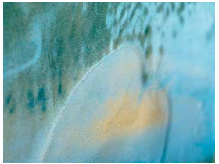
The Pictoglas image surface can be formed into relief.